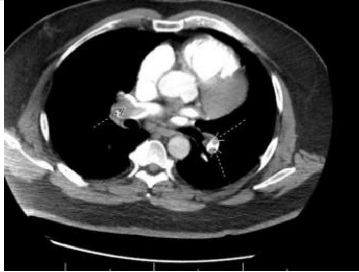
Figure 3: Computed tomography angiogram of the chest showing extensive bilateral pulmonary embolisms (see arrows).