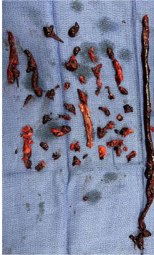
Figure 2: Macroscopic Image showing multiple thrombi of varying shapes and sizes with some fibrotic changes consistent with subacute/chronic evolution.

Macroscopic analysis following removal had findings consistent with chronic thrombus with fibrotic changes (Figure 2), this was later confirmed with pathology. Repeat TEE showed complete resolution of RiHT (Video 4).