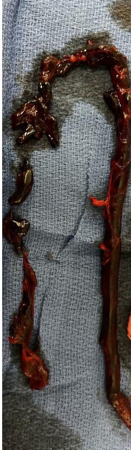
Figure 4: Macroscopic Image showing a serpiginous mass-like thrombus after percutaneous extraction.