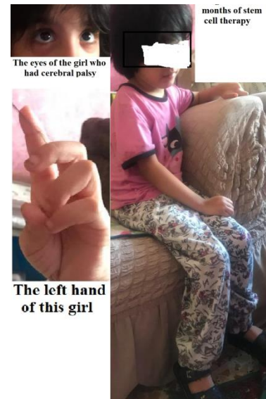
Figure 3: Three pictures of this girl four months after stem cell therapy.

Later, after four sequential months of one injection per month of stem cells injections, the parents noticed gradual advancement of the mentioned girl state. They recorded her progress in a video with acknowledgments. So, stem cells could modulate cerebral palsy treatment.