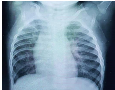
Figure 1 AP chest X-ray. Bilateral inflammatory lesions are seen.

Hemoglobin: 17g / dl Hematocrit: 0.54 Leukocytes: 15 \times 10^9 / l Segmented: 14% Lymphocytes: 84% Platelet count: 302 \times 10^9 / l Creatinine: 67 mmol / l Glycemia: 7.3mmol / l, D-dimer positive, with slight metabolic and lactic acidosis 5.1mmol / l. Chest radiograph with evidence of bilateral inflammatory-looking lesions. (Figure. 1)