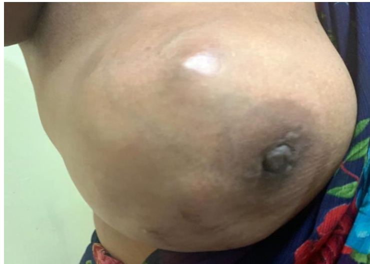
Figure 1: clinical image showing enlargement and disfigurement of right breast.