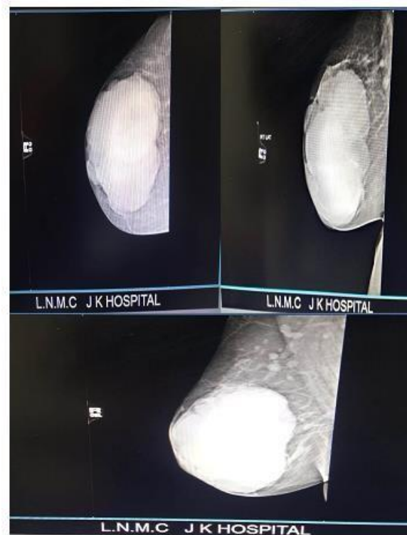
Figure 2, 3, 4: mammographic CC, LAT & OBL projections showing well defined, encapsulated, lobulated high density lesion in right breast.

Well defined large sized encapsulated, lobulated high density mass lesion with well-defined margins occupying right breast. A radiolucent halo is seen around the lesion.No evidence of pleomorphic microcalcifications seen.