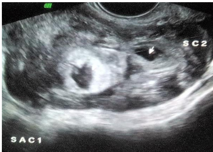
Figure 3: Trans vaginal Sonography shows Right adnexa heterogenous mass with two irregular sacs and hemoperitoneum. Left ovary is visualised .

Histopathology report came out to be right adnexal two gestational sacs were noted.