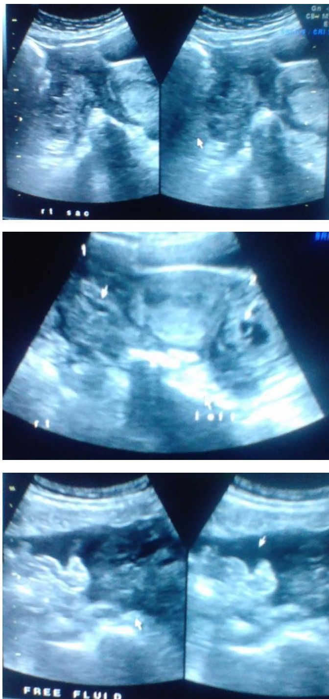
Figure 4: Trans vaginal Sonography shows both adnexae heterogeneous mass with two irregular sacs and hemoperitoneum. Both ovaries are visualized.