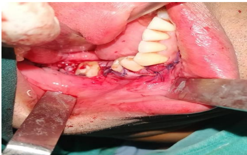
Figure 6: Closure done

Curettage was done and the bony cavity was packed with PRF to accelerate healing. The flap was then approximated with resorbable 3-0 vicryl sutures. (Figure 6)