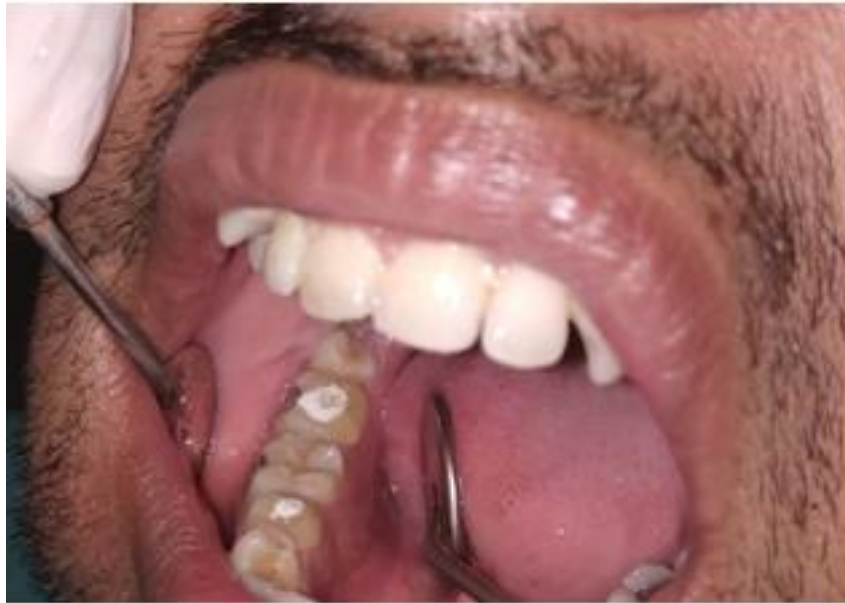
Figure 2: Lingual extension of the lesion

A provisional diagnosis of periapical cyst was made.