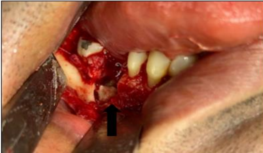
Figure 4: Exposed odontoma

The bony mass was sectioned and delivered in parts and sent for histopathological evaluation (Figure 5).