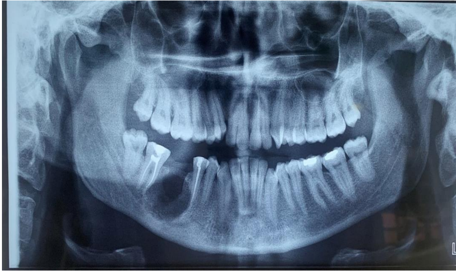
Figure 7: Post-operative OPG

hygiene. Patient was recalled after 7 days for suture removal and post op OPG was done. (Figure 7).