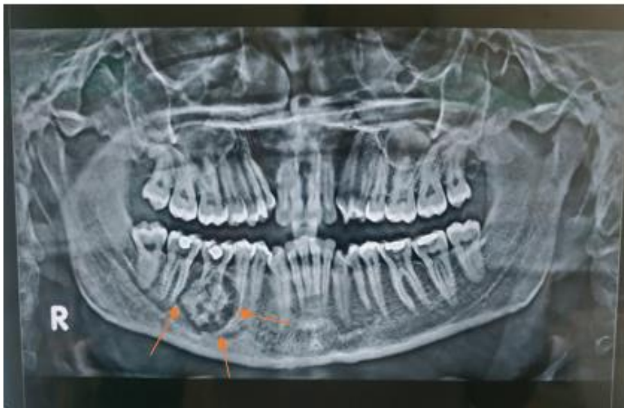
Figure 3: OPG revealing the radioopacity at the root apex of 46

46. The radiopaque mass was encased by a well -defined radiolucent borders suggestive of the lesion being well localized and well circumscribed. (Figure 3)