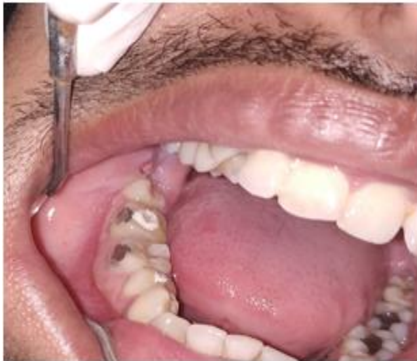
Figure 1: Buccal vestibular extension of the lesion

present in buccal vestibule extending from 45 to 47 obliterating the buccal vestibule (figure 1). The swelling also seen in lingual vestibule in 46 and 47 region (figure 2). The color of the swelling was normal as that of mucosa. On palpation the swelling was smooth and firm hard in consistency. No evidence of crepitus or pathological fracture was seen. Hard tissue examination revealed buccal pits restored with amalgam restoration in relation to 46 and 47. The tooth 46 was found to be tender on percussion.