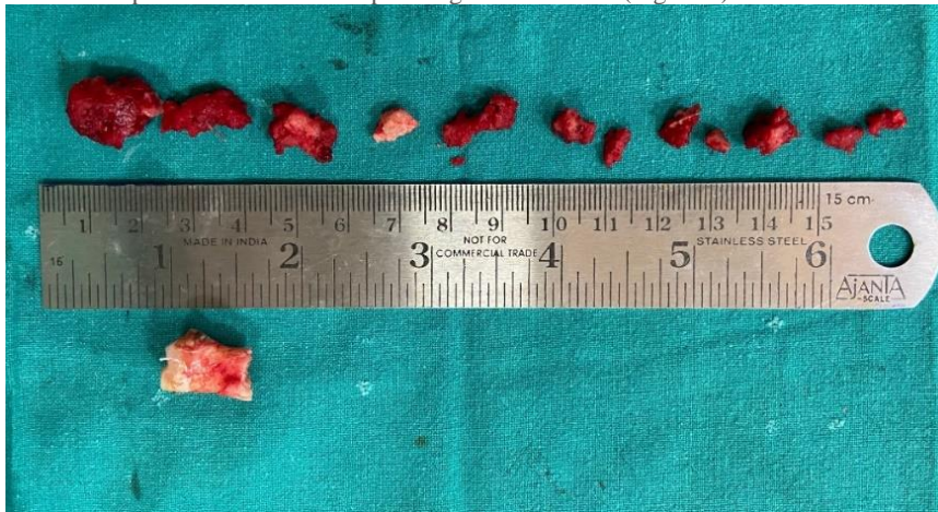
Figure 5: Removal of odontoma and tooth

The bony mass was sectioned and delivered in parts and sent for histopathological evaluation (Figure 5).