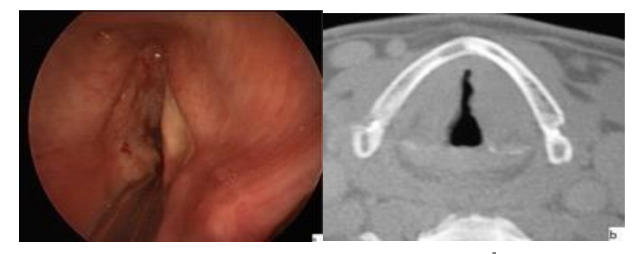
Figure 3: a-Direct laryngoscopy: ulcerated tumor of the left CV with CA involvement and conserved mobility. b- CT scan: Irregular hypodense lesion of the right vocal cord with thickening of the anterior commissure.