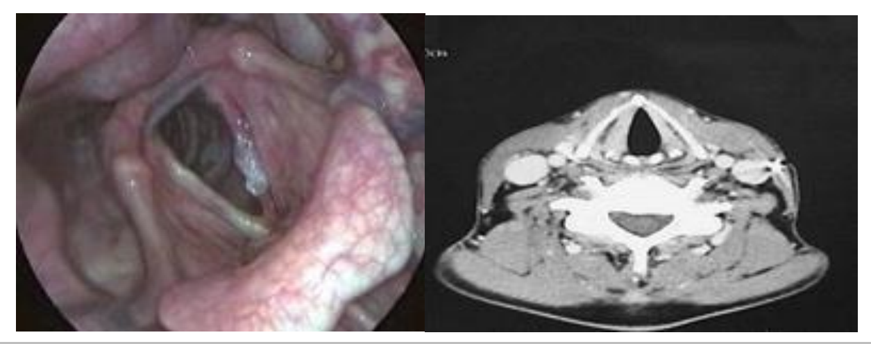
Figure 1 : Right Image-Direct laryngoscopy: tumor of the anterior 1/3 of the right CV without reaching the CA. Mobility is preserved. Left image-CT scan: normal (false negative).