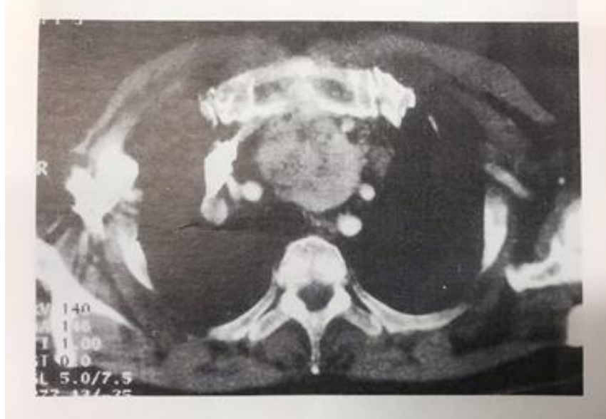
Figure 1: Neck-mediastinum CT scan revealing the mass located in the anterior superior mediastinum.

Neck-mediastinum CT scan (Fig 1) revealed that the mass was strongly impregnated after the introduction of the contrast medium, located in the anterior superior mediastinum with tracheal compression and situated in a posterior contralateral site.