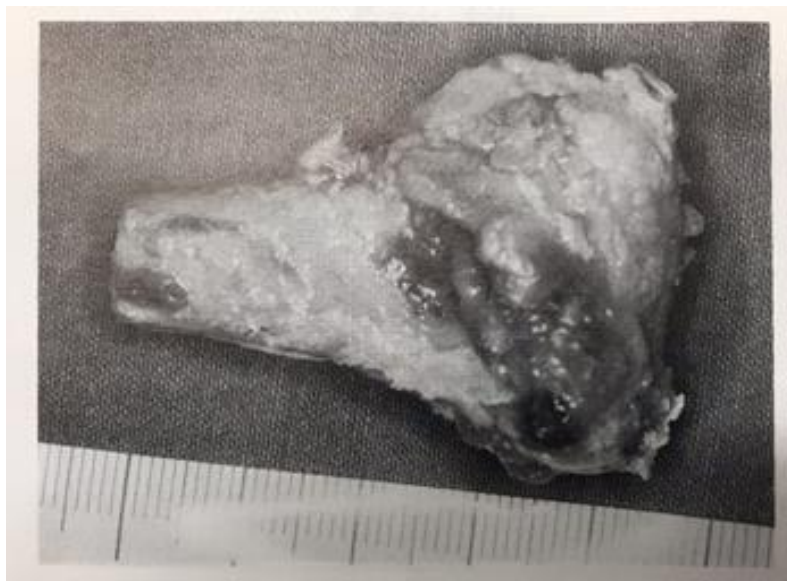
Figure 2: The resected left middle third of the clavicle.

After removal of the previous surgical scar, the surgical access consisted of a standard transverse cervicotomy (Knocker's incision). The left anterolateral incision of the neck was occupied by a voluminous goiter extending from the thyroid left lobe and isthmus and encompassing most of the mediastinum. On the right, where the previous operation had been carried out, thyroid material was absent but an inextricable sclero-cicatricial process was present, with diffuse involvement of the vasculo-nervous bundle.