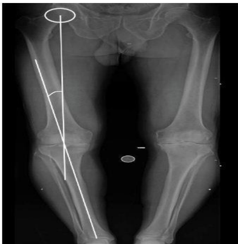
Figure 1A: Measurement of mechanical axis with standing hip-knee-ankle radiograph