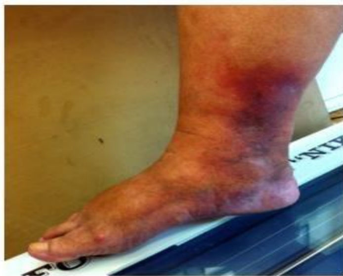
Figure 1. Patient's foot affected with diabetic

Diabetic foot syndrome is a complex of anatomical and functional changes that occur in 40-60% of patients with diabetes mellitus. It is believed that a high blood glucose content reduces its fluidity, impairs arterial and capillary blood circulation (angiopathy), leads to damage to the vessels and nerves of the lower extremities, and to a disorder of muscle innervation processes (neuropathy). At first, gangrene develops on one leg, which can be seen from the swelling and color difference of the skin of the legs, the appearance of a feeling of "foot in a trap", when its squeezing is felt, the temperature of the tissues rises. Today, 50-70% of lower limb amputations in the world are among people with diabetes. After amputation of one limb, in 2-3 years the other is amputated and within 5 years up to 50 percent of patients die. Doctors talk about the need to unload the feet, for which they recommend wheelchairs and crutches. But no one says that the deterioration of arterial blood flow is a consequence of a violation of the outflow of venous blood. Disrupted work of the venous-muscular pumps of the feet, thighs and abdominal region. 75% of blood and 80% of muscle mass are in the structures of the legs, 85% of people have deformities of the feet, we do not walk properly and do not walk much. But the work of the leg muscles is estimated at 94% in the circulatory system and one hundred percent in the lymph circulation system.