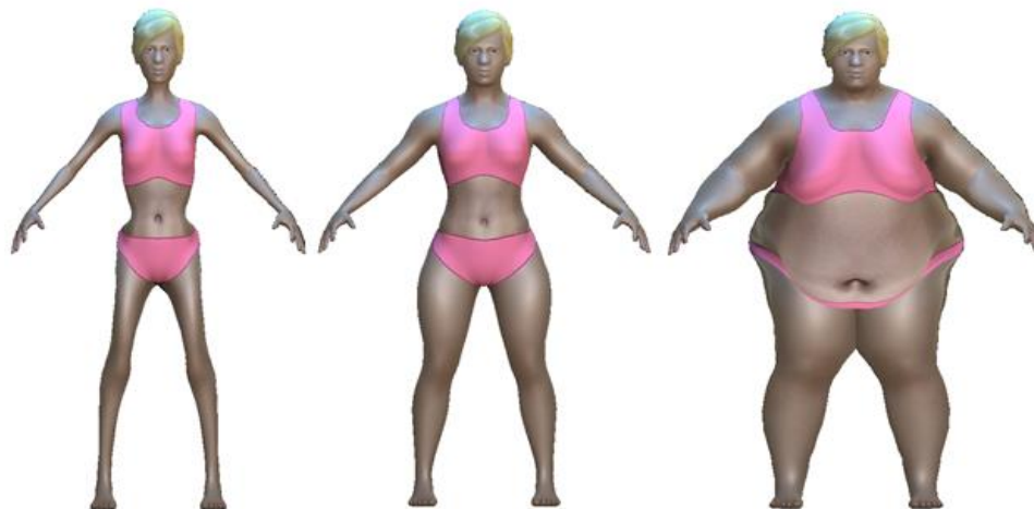
Figure 1: 3D Avatar illustrating the underweight – average – obese continuum (anterior).

The questionnaire that was used was not pre-validated and was designed in line with literature relating to body image and body dissatisfaction amongst females [22]. A pilot study was conducted prior to data collection to reduce the risk of participants' confusion and to ensure their understanding of the given questions. In doing so, it reduced any risk of typing/wording errors, respondent confusion and bias [1]. The questionnaire consisted of closed questions and was presented in 3 parts (A: personal details; B: Calculated BMI and C: Perceived Body Image). Whilst the preferred approach to this study would have been to use a 3D image of a woman that is able to rotate 360° and can visually slide from underweight to average to obese continuum, this was unable to take place due to COVID-19 pandemic. The software for the computer generated avatar was unable to be accessed, therefore, alternative 2D screen shots were taken illustrating 10 different images (ranging from anterior, lateral, and posterior and from underweight to average to obese continuum) (see Figure 1). Participants were asked to identify one of the images which best represented their body, thus their perceived BMI.