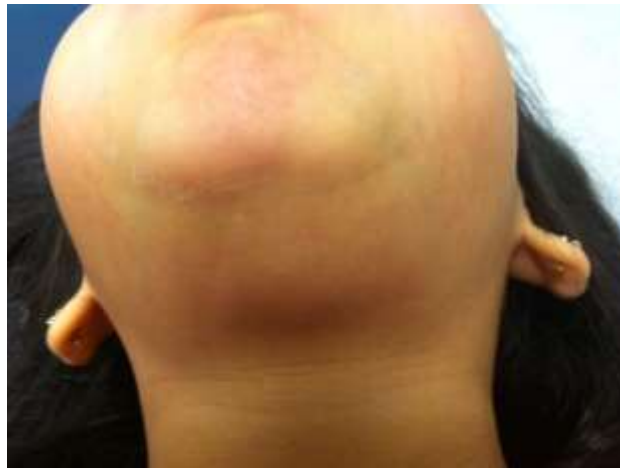
Figure 1: Inferior view of submental mass measuring 3x2.5cm