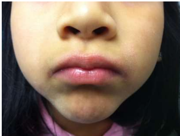
Figure 2: Perioral dermatitis