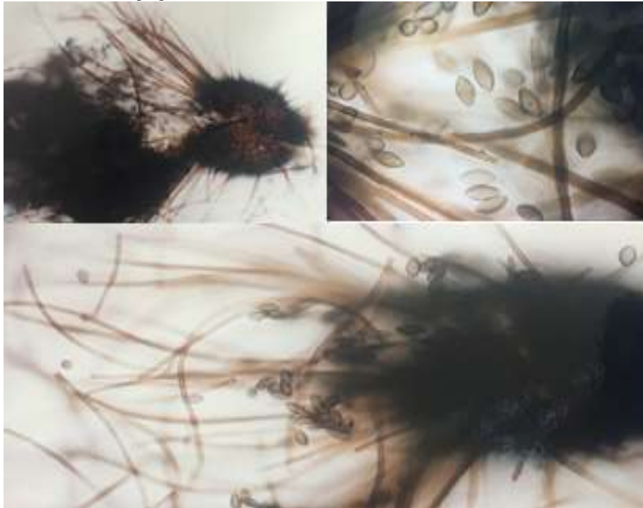
Figure 1. Chaetomium species with spiral setae and with oval ascospores. isolated and identified by Dr. Waill Elkhateeb (Photographs was taken by Dr. Waill A. Elkhateeb, Locality: National Research Center of Egypt).

are cosmopolitan and prevalent component of different ecosystem in a wide range of environments and climatic zone [24].