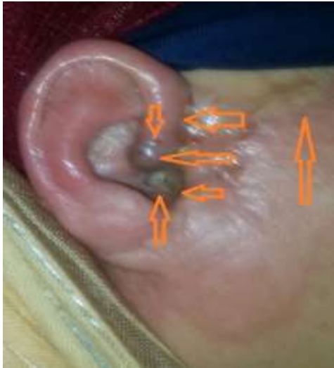
Figure (2): normal left ear