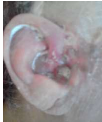
ear and adjacent areas, removal of cancer cell after Bee Venom subcutaneous injection.