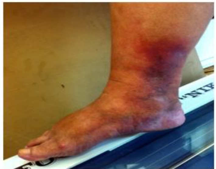
Figure 1. Patient's foot affected with diabetic

Diabetic foot syndrome is a complex of anatomical and functional changes that occur in 40-60% of patients with diabetes mellitus. It is believed that a high blood glucose content reduces its fluidity, impairs arterial and capillary blood circulation (angiopathy), leads to damage to the vessels and nerves of the lower extremities, and to a disorder of muscle innervation processes (neuropathy). At first, gangrene develops on one leg, which can be seen from the swelling and color difference of the skin of the legs, the appearance of a feeling of "foot in a trap", when its squeezing is felt, the temperature of the tissues rises. Today, 50-70% of lower limb amputations in the world are among people with diabetes. After amputation of one limb, in 2-3 years the other is amputated and within 5 years up to 50 percent of patients die. Doctors talk about the need to unload the feet, for which they recommend wheelchairs and crutches. But no one says that the deterioration of arterial blood flow is a consequence of a violation of the outflow of venous blood. Disrupted work of the venous-muscular pumps of the feet, thighs and abdominal region. 75% of blood and 80% of muscle mass are in the structures of the legs, 85% of people have deformities of the feet, we do not walk properly and do not walk much. But the work of the leg muscles is estimated at 94% in the circulatory system and one hundred percent in the lymph circulation system.