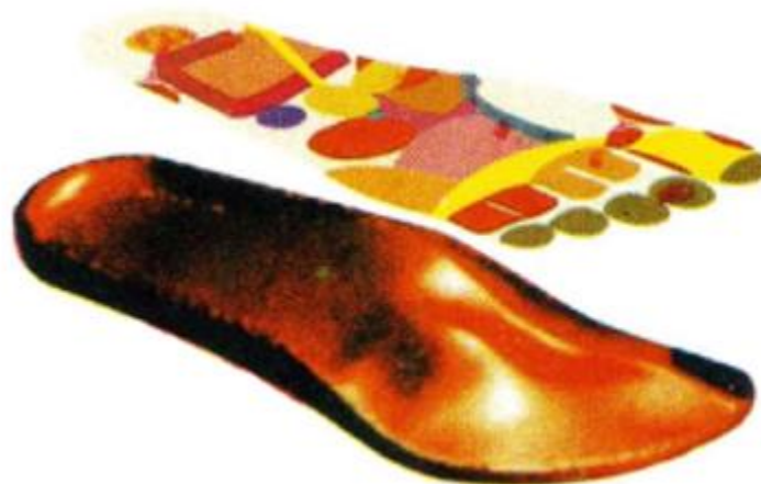
Figure 3. Rag Shoe Insole

work, we point out to patients that they should not use drugs without the agreement of the treating doctor. Bio-podocorrectors are not only orthopedic insoles, but also a means of reflex informational influence on the body. The body's energy comes to a balanced state as soon as the feet touch the insoles. The body reaches a stable state after 7 days.