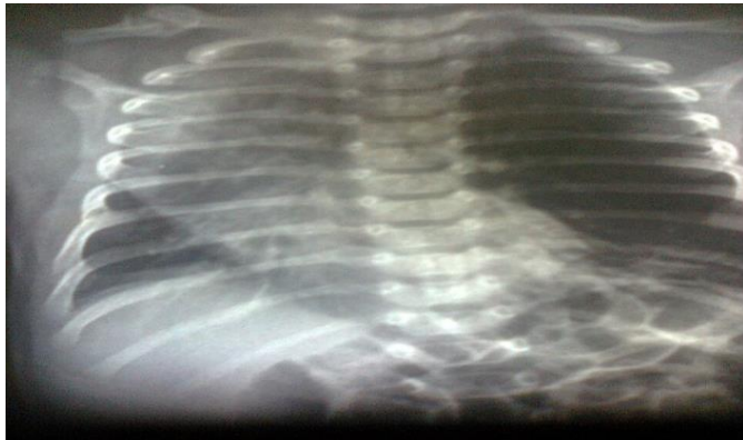
Figure-1: Chest X ray showed increased translucency of left lung field and mediastinal shift to the right