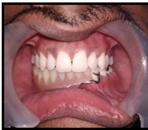
Figure 3A: Rehabilitation of edentulous space at 6 months post-operatively