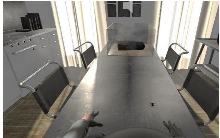
Figure 3. SPIDERS ENVIRONMENT

When the virtual reality experience was initiated, the fish bowl's front wall opened which triggered a scripted 3 minute animation where the spiders moved out of the fish bowl, approached the subject's end of the table and stopped 5cm away from the subjects' virtual hands. (Figure 3)