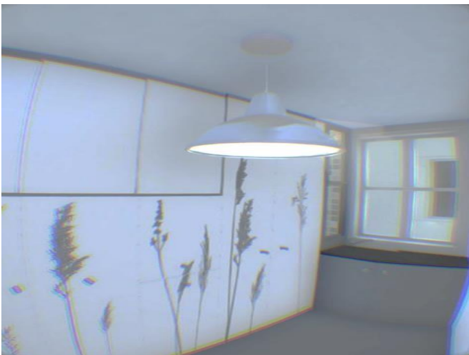
Figure 2. Apartment Environment

Small Apartment. The scenario includes a small, modular apartment which consisted of a 2x4m area. Within this area, there was a sink, a bathroom which view was occluded by a door and a closet embedded on the wall. (Figure 2)