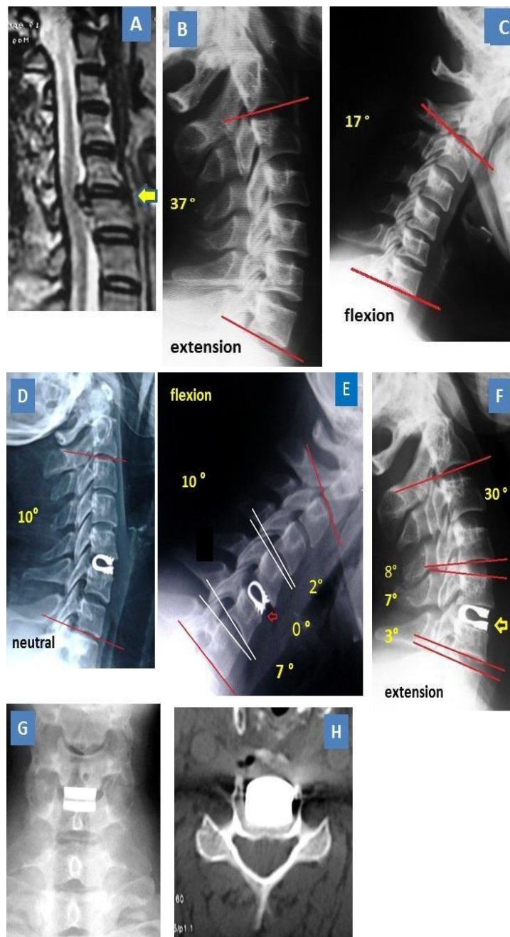
Figure 2: 39 ys old lady with C5-6 DDD; (A) preop. MRI, (B&C): preop. Dynamic views: 46^\circ GROM, (D) final lateral neutral view: good position of DCI & 10^\circ overall lordosis, (E&F): final dynamic views: maintained 7^\circ ROM at implanted level, good GROM & no hypermobility of adjacent levels, (G&H): good position of DCI.

To reduce the formation of HO after DCI, osseous and soft tissue bleeding was meticulously controlled, blood and bone dust were washed, and damaged bone was covered with bone wax, (7) Wound closure over a drainage tube, (8) wear a cervical collar for one week after DCI and four weeks after ACDF.