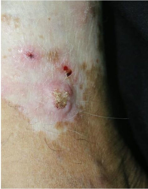
Figure 2: Crateriform nodular injury at the medial lower third of the right leg

In July 2017, the patient returned showing crateriform nodular injury, erythematous, measuring 1,3 cm, located at the edges of vitiligo injuries on left pretibial area and nodule injuries measuring 1cm on the anterior side of the right leg and 0,9cm at the medial lower third of the right leg (Figure 2).