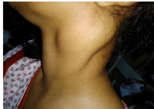
Figure 1: depicts the clinical photograph depicting the swelling in a image captured from a left lateral position while the patient was in an erect posture.

Swelling was non tender, non-pulsatile, slightly mobile and did not move with deglutition. Bilateral carotid pulsations were felt. The skin over swelling was freely mobile and was not associated with any skin changes. There was no paresthesia over skin. [Figure 1]