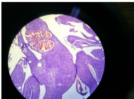
Figure 2: Shows a well circumscribed tumour. It showed large cystic areas and cystic spaces, lined by spindle tumour cells which were arranged in bundle in streaming fashion.

On microscopic examination the tumour was well circumscribed. It showed large cystic areas and cystic spaces, lined by spindle tumour cells which were arranged in bundle in streaming fashion. Individual cells had moderate eosinophilic cytoplasm with elongated wavy nuclei which at places showed Verocay body formation. Some of these foci showed increased intervening matrix, representing Antony B areas. Some areas showed crowding of cells representing Antony A areas. There were well distributed dilated and congested spaces. Vascular channels were seen. No mitoses or areas of necrosis were identified. [Fig 2, 3] These findings confirmed the diagnosis of schwannoma with cystic change.