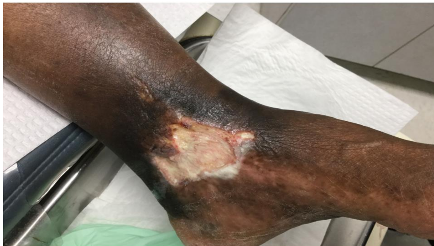
Figure 2: Left Medial Full Thickness Ulceration to the level of Subcutaneous Tissue Medial Malleolus