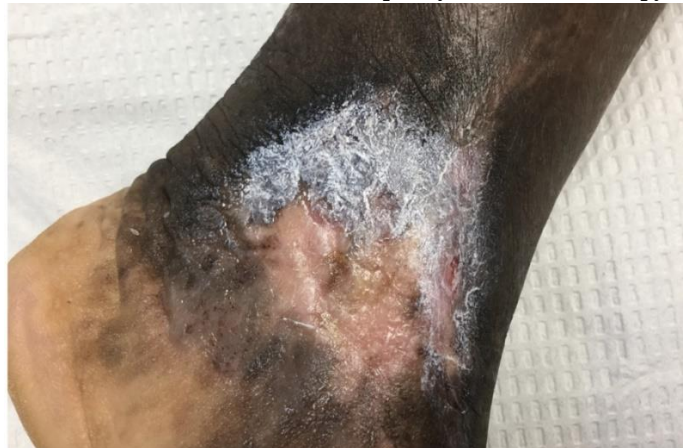
Figure 4: Complete Healed with Epithelialization