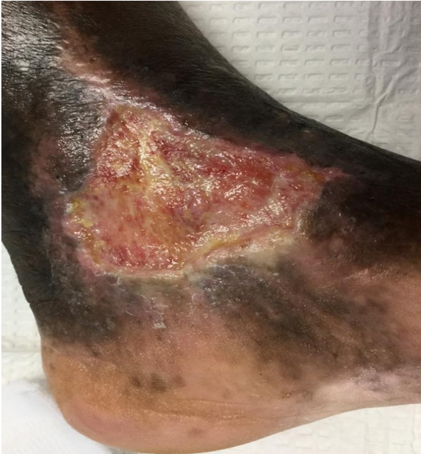
Figure 3: Healing Full Thickness Ulceration with Granular Base 9 Months After Initiation of Low-Frequency Ultrasound Therapy