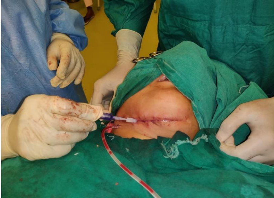
Figure 2. (Application of tissue adhesive glue)