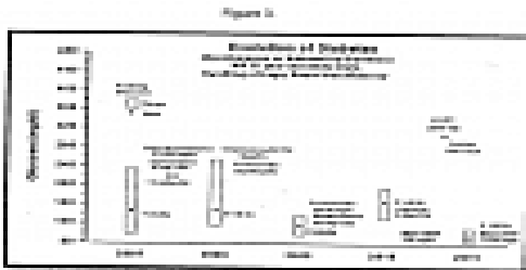
Figure 3: 2hPP = 2 hour post prandial glucose.