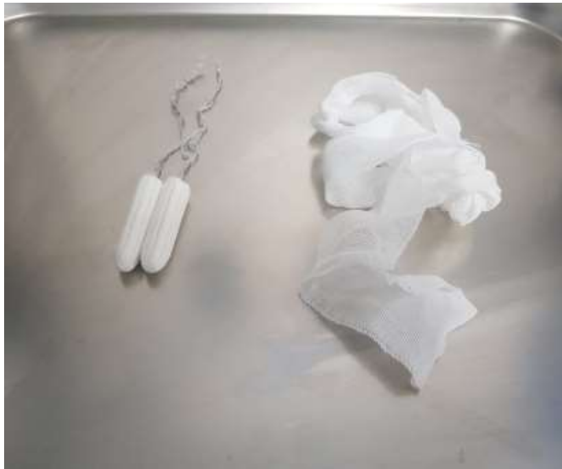
Figure 1.1: Pharyngeal tampons (left) and conventional gauze throat packs (right).