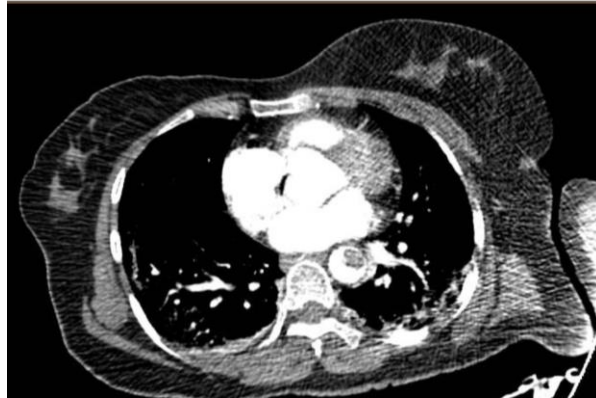
Figure 2 CT angiogram descending aorta thrombosis.