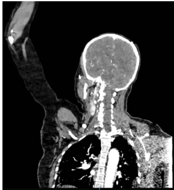
Figure 1 CT angiogram descending aorta thrombosis. And axillary artery thrombosis