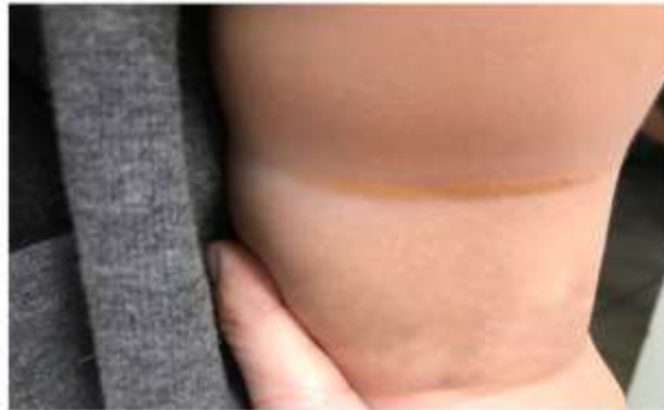
Figure 2: Xanthomatous lesion within right popliteal crease. A less commonly appreciated linear appearing xanthoma is shown in this image.