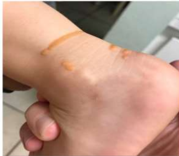
Figure 1: Xanthomatous lesions over right ankle. Classic appearing pediatric xanthomas are seen.