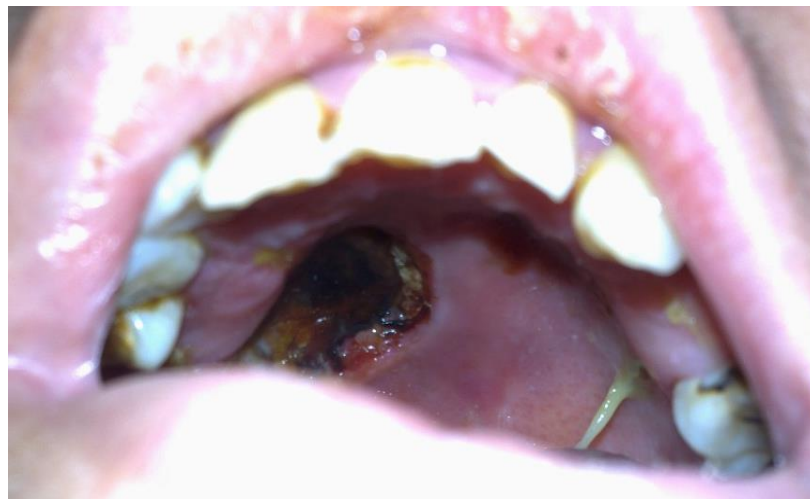
Figure 4. A case of palatal mucormycosis