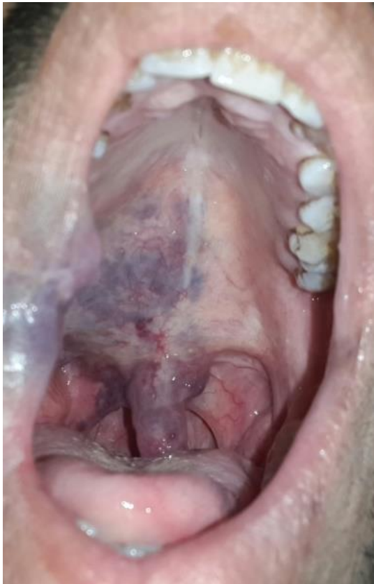
Figure 5. The case of palatal minor vascular malformation