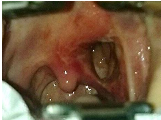
Figure 3. A case of palatal injury