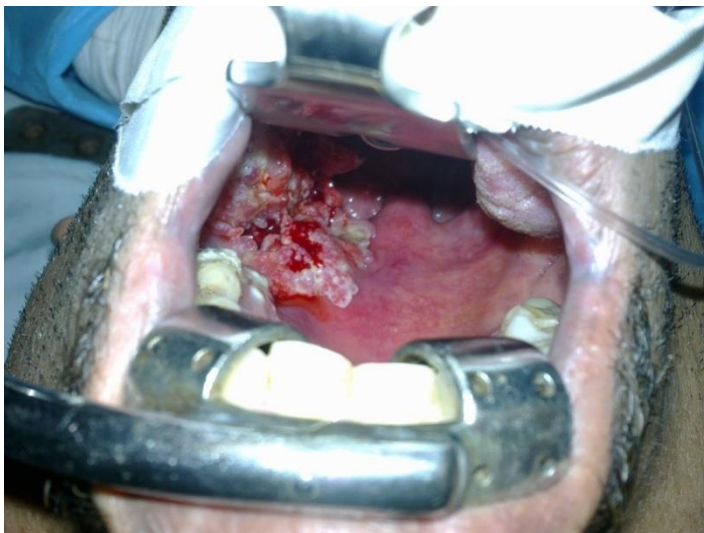
Figure 6. A case of palatal squamous cell carcinoma