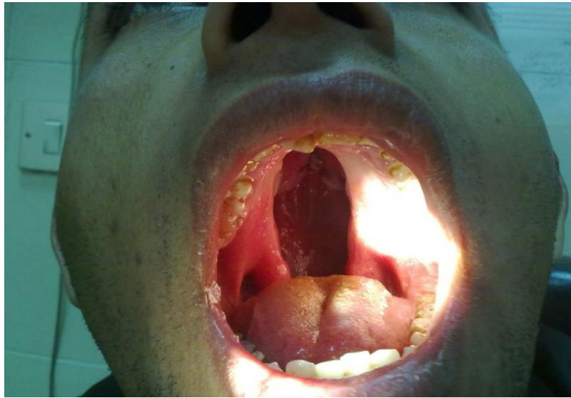
Figure 2. The case of cleft palate, 26years old patient