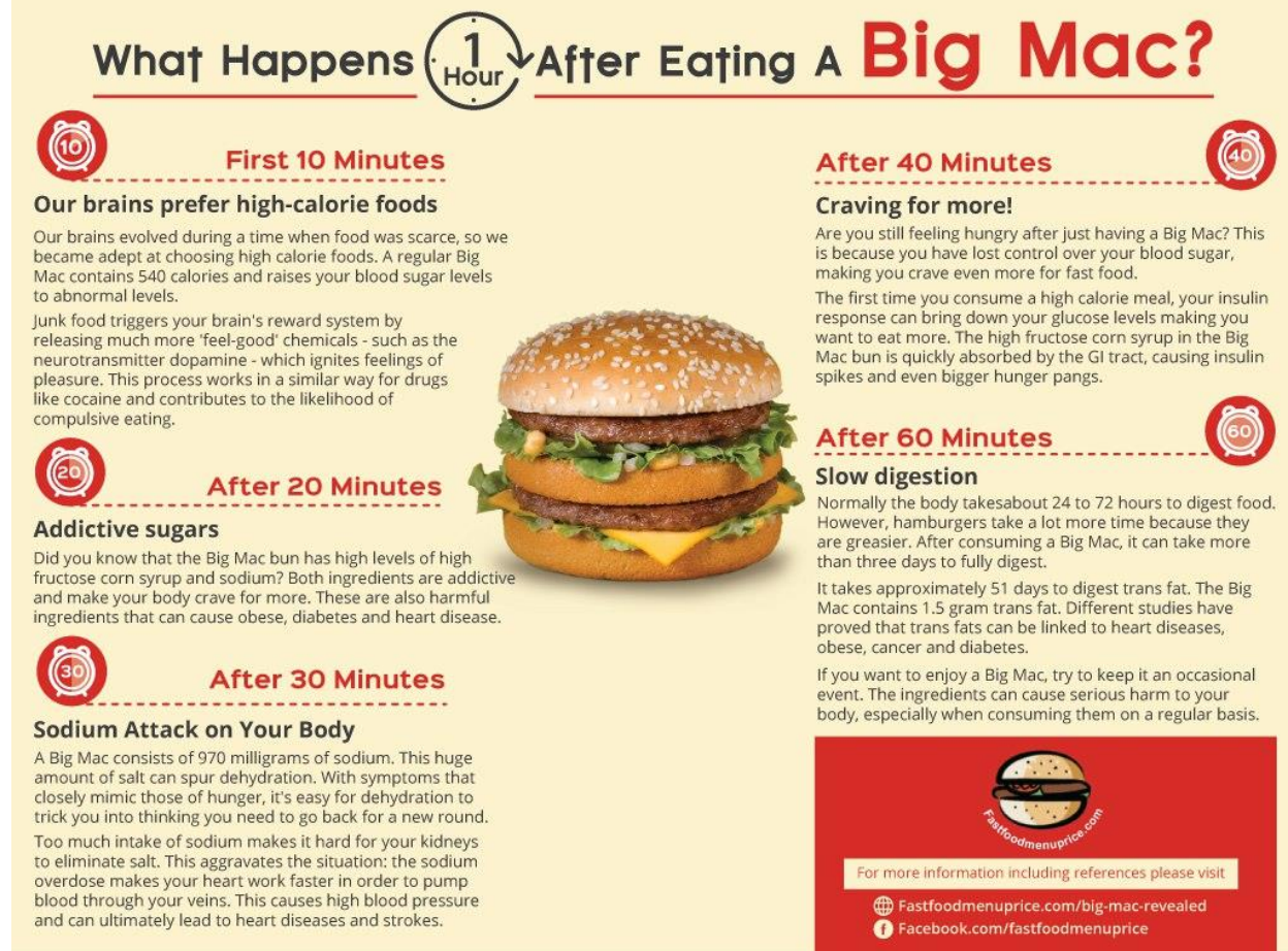
Figure 2: One Hour after Eating a Big Mac. The website 'Fast Food Menu Price' created this infographic outlining what happens to body inside after an hour following ingestion of a Big Mac. It also might shed some light on why we all like fast food so much, even though we're aware it's bad for our health.

Bangladesh, Hossain et.al, 2019 reported that nearly 65% of the mothers of preschool aged children were not aware of childhood obesity as a health problem [8]. Fast food consumption habit has been found as a potential risk factor for overweight and/or obesity among children in other studies [9, 10]. Also, Al MuktaDir et.al, 2019 reported that (systematic random sampling attending in 27 established public and private universities) more than 40% of the youth went to fast food restaurants at least once per week and over 27% went regularly (2 times/week). Youth having fast foods 2 times/week, consuming soft drinks 3-4 times/week were more likely to be obese [11]. Processed and fast foods contain high amounts of saturated fats. Fast foods reduce the quality of diet and provide unhealthy choices especially among children and adolescents raising their risk of obesity.