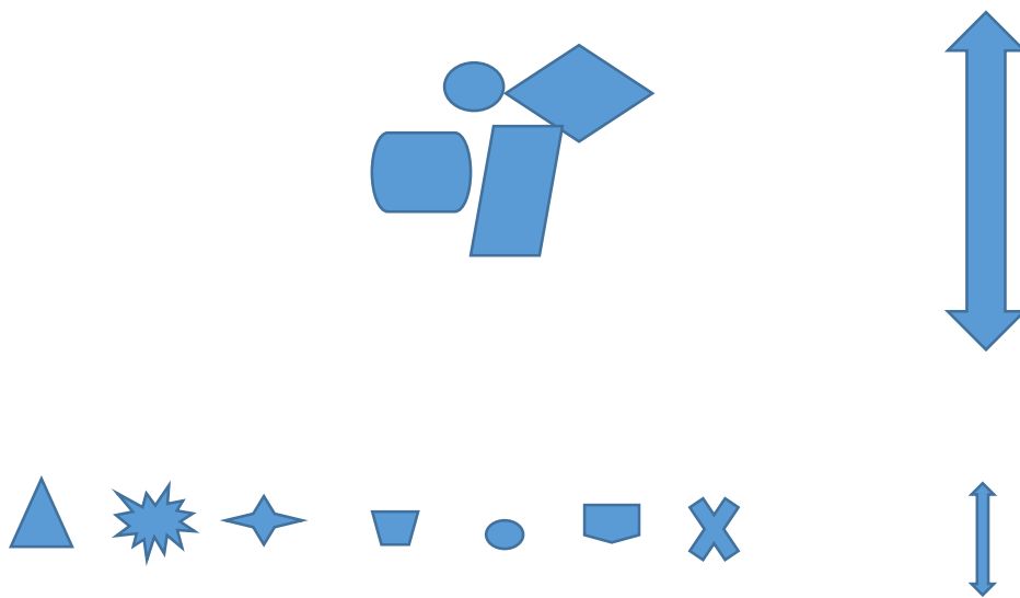
Figure 3. Visualization of Distribution dependent correlations , encountered with a family Cluster of fatty acids (top), where the members have high variability (shown by length of arrow), and a group of fatty acid (bottom row) with low numbers/variabilities. Hypothetically, Cluster fatty acid percentages are suggested to oscillate with large amplitudes; those of the other group, with small ones. The particular distributions of the fatty acids make within-group ( between-group ) percentages to correlate positively ( negatively ), see text.

A schematic illustration of Distribution dependent correlations , as observed in chicken breast muscle, is shown in Figure 3. Group 1 fatty acids make a cluster (top group) in which the members (mostly) have high numbers and high variability, as compared with Group 2 fatty acids (bottom row). Hypothetically, Cluster fatty acid percentages are suggested to oscillate with large amplitudes; those of the other group, with small ones. The particular distributions of the fatty acids make within-group ( between-group ) percentages to correlate positively ( negatively ), as explained above.