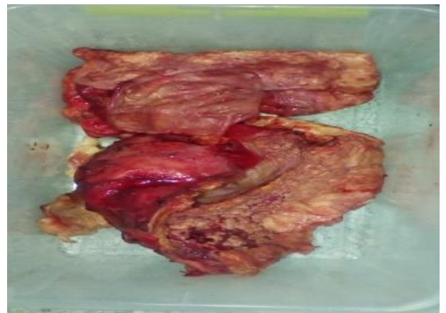
Fig. 7 Total Splenectomy with Large Cyst