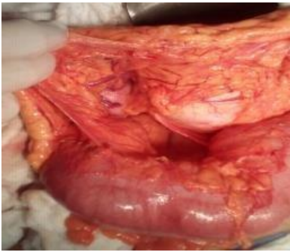
Fig. 3 Adhesion with Colon

Laparotomy was performed through a midline incision. Surgical exploration revealed a hydatid cyst occupying whole splenic parenchyma. The mass measuring approximately 300 \times 200 mm was attached to left diaphragm and the stomach Fig.3, 4. The rest of the abdominal organs were normal. The abdomen was washed locally with peroxide hydrogen Peroxide ( H_2O_2 ). The surgical intervention was radical as splenectomy carrying the cyst with difficulties because the latter had relations with the kidney, the stomach and the diaphragm Fig. 4. On cut section, there was hydatid sand and fluid around four liters and daughter's cysts Fig.6. Total removal of the cyst with the spleen Fig.7. The postoperative period was uneventful and the patient was discharged on the postoperative day 7. The clinical and ultrasonography follow-up did not show any evidence of recurrence at six months. After the splenectomy, the patient was given prophylactic vaccination (Streptococcus pneumoniae, Haemophilus influenza type b and Neisseria meningitidis,) and was started on a six-month course of prophylactic penicillin.