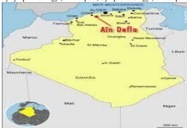
Fig. 1 (Map).

We report below the case of a 28 year old male; originally from Ain Defla (Fig. 1) and living there, without any particular history; in whom the discovery of this pathology was fortuitous during the exploration of a urinary symptomatology (lumbar pain). Symptomatology (lumbar pain).