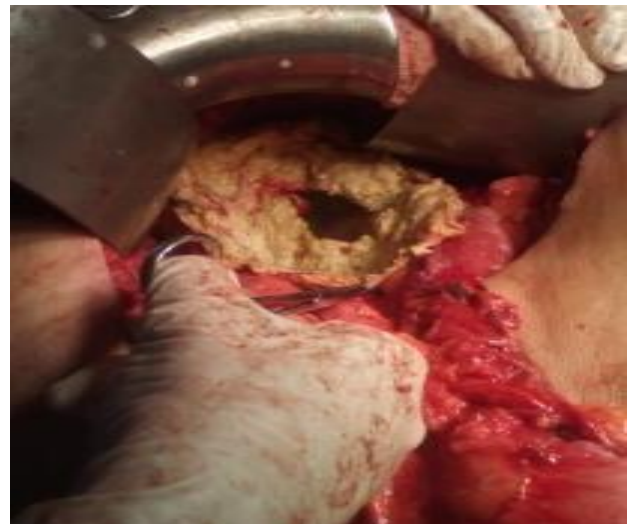
Fig. 6 Cavity of Cyst