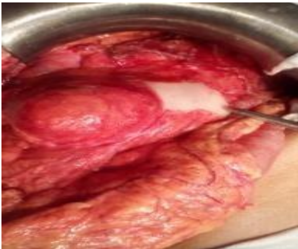
Fig. 4 Adhesions with Diaphragm