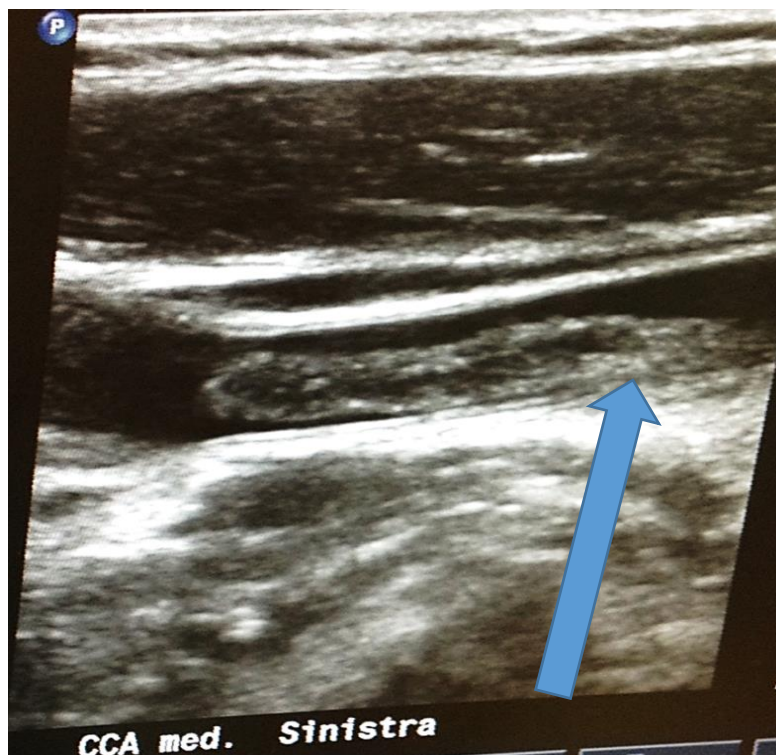
Figure 2: Ecodoppler of left carotid bifurcation: the arrow indicate the site of dissection and the origin of floating thrombosis

In another case, CEA was performed in a patient with an ischemic stroke and floating thrombosis in dissection of the common carotid artery after cervical trauma caused by beatings ( Figure 2 ) [7].