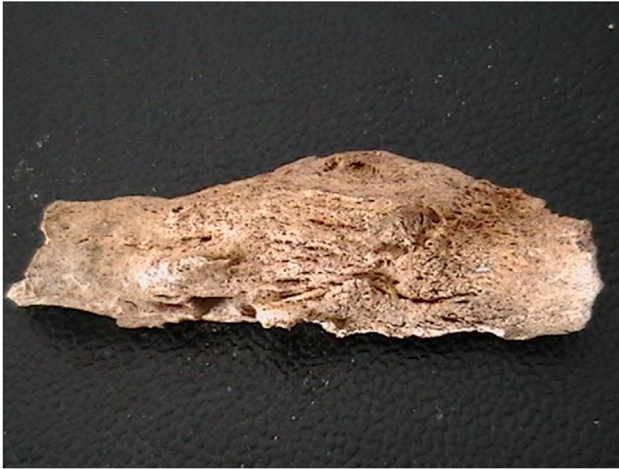
Figure 1: Tibia specimen measuring 8 cm X 3 cm showing periosteal thickening, cortical irregularity and a large number of crypts.