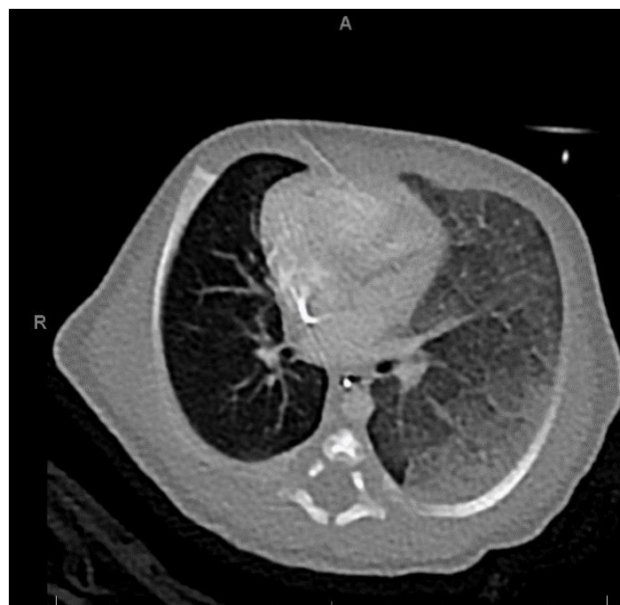
Figure 2: CT scan of the chest. Ground-glass attenuation and interlobular septal thickening of the overinflated left upper lobe.

While awaiting palliation, at six days of age, he required endotracheal intubation for worsening respiratory acidosis and LUL hyperinflation on chest radiograph. Fluid resuscitation and inotropes were initiated to improve systemic perfusion. After multidisciplinary discussion, he underwent an uncomplicated LUL resection the following day. Intraoperative findings included fusion of the anterior fissure, lingula, and