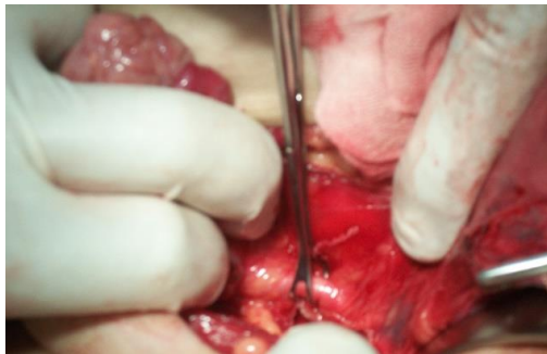
Identification of the ureter