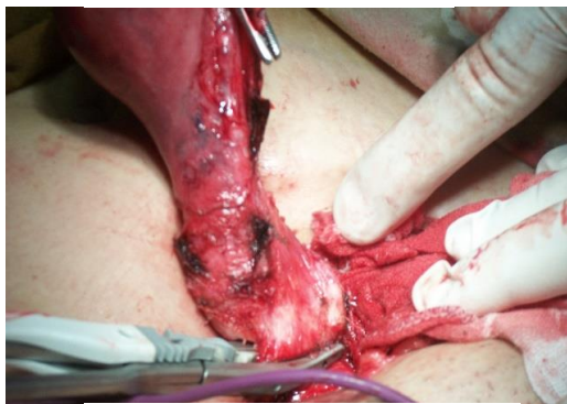
Removal of the uterine specimen