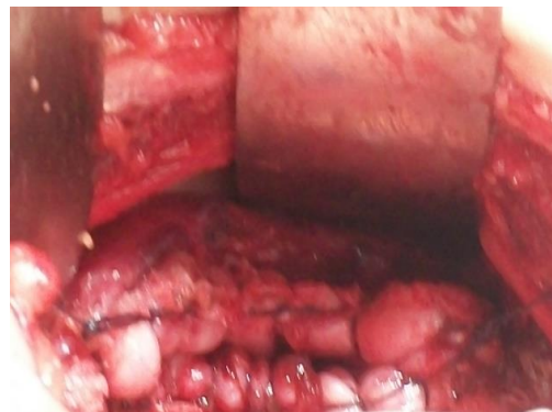
Open-cuff closure of the vault