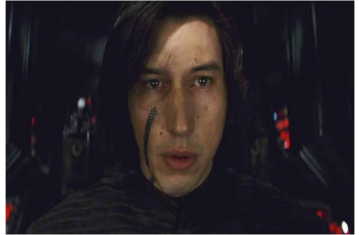
Figure 3: Kylo Ren, from Star Wars, The Last Jedi sporting what must be a collagen/CNB bandage. https://www.popsugar.com/entertainment/Kylo-Ren-Scar-Star-Wars-Last-Jedi-44127899

In Figure 3, we see Kylo Ren is sporting what must be a collagen-CNB wound covering to help heal a light saber injury to the face. Notice the carbon cloth weave and texture and the carbon-black color of the dressing.