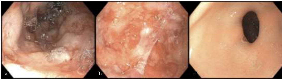
Figure 1: Endoscopic view of markedly thickened gastric folds, with overlying erosions and exudates involving the gastric fundus (a), body (b), and unaffected antrum (c).

Upper endoscopy revealed severe erosive gastritis involving gastric fundus and body, with normal mucosa in the gastric antrum ( Figure 1 ).