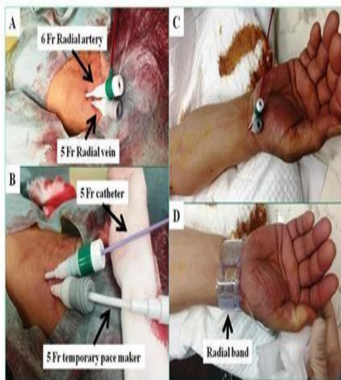
Figure 1: Procedures of radial artery and vein approach catheterization and hemostat device of radial band